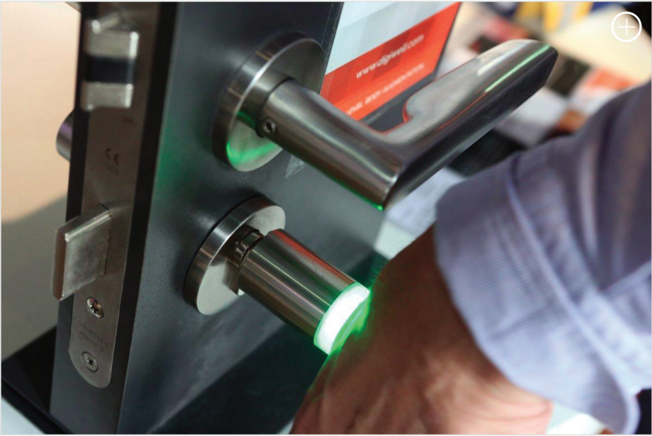
The technology will allow for employees to unlock doors, access computers and purchase things from their break room market.

The technology will allow for employees to make purchases in their break room, open doors, log in to computers and access the copy machine all by scanning the chip.